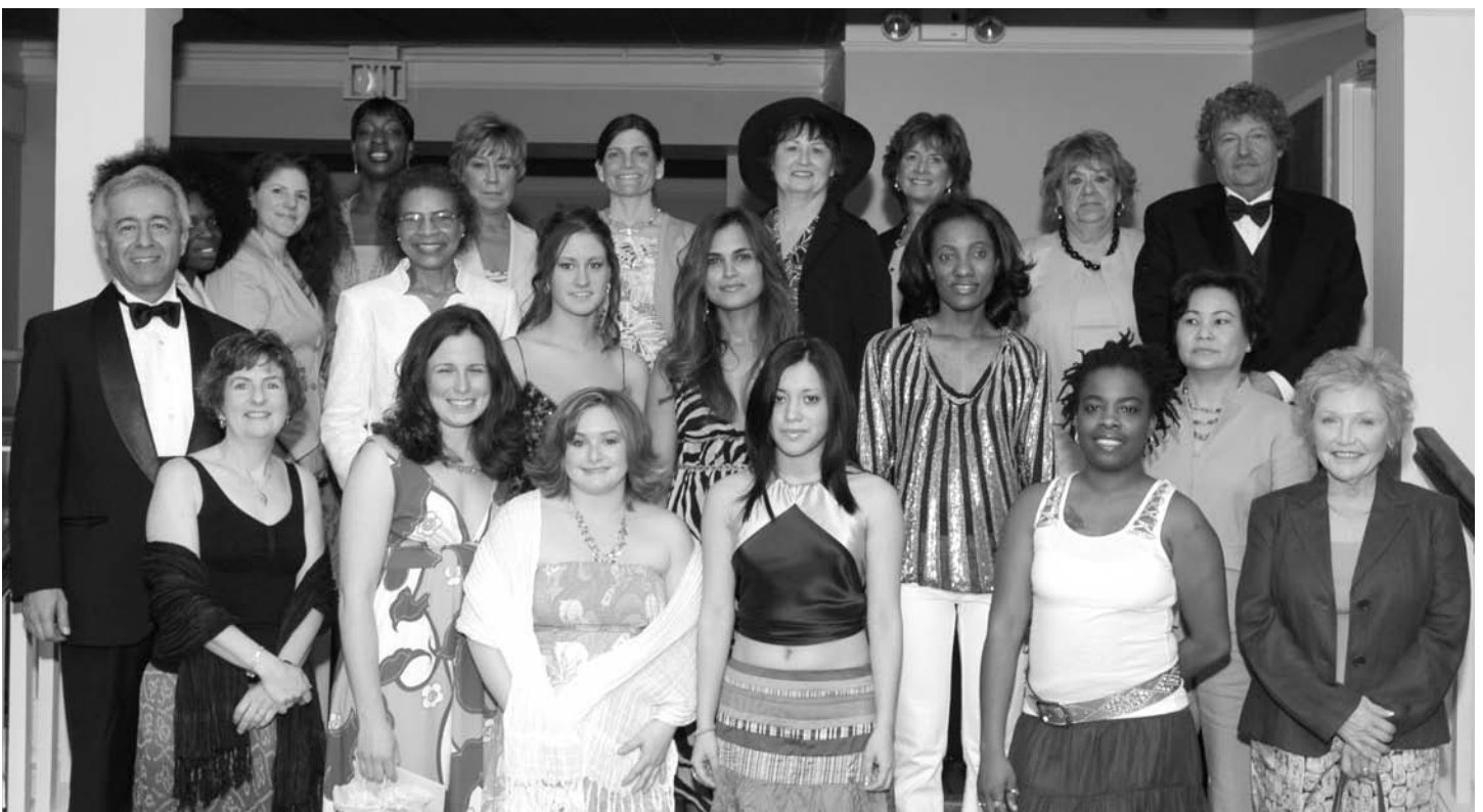
Faculty, staff and student models assembled for a group photo at the conclusion of the show. (below)