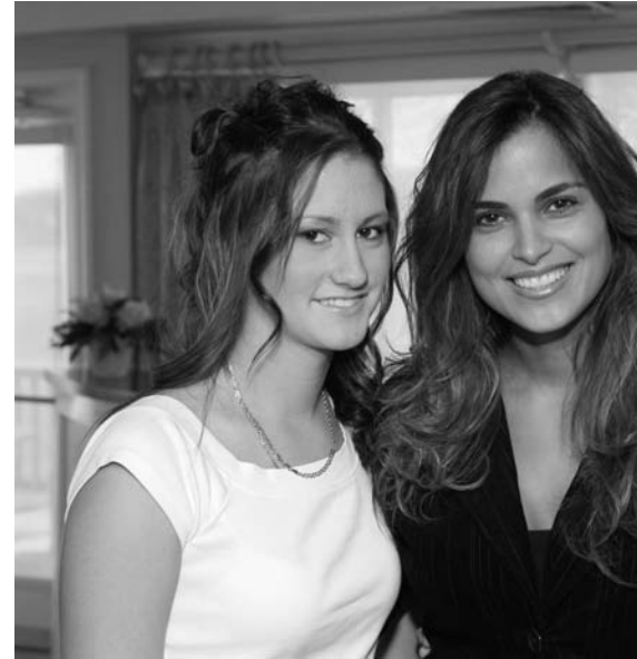
“It was a lovely event that truly showcased Housatonic Community College through its faculty, students and staff. It definitely has the potential to become yet another successful annual fundraiser for the Foundation,” she said.