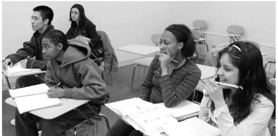
Bassick and Harding High School students participate in a Middle College Pilot Program math class.