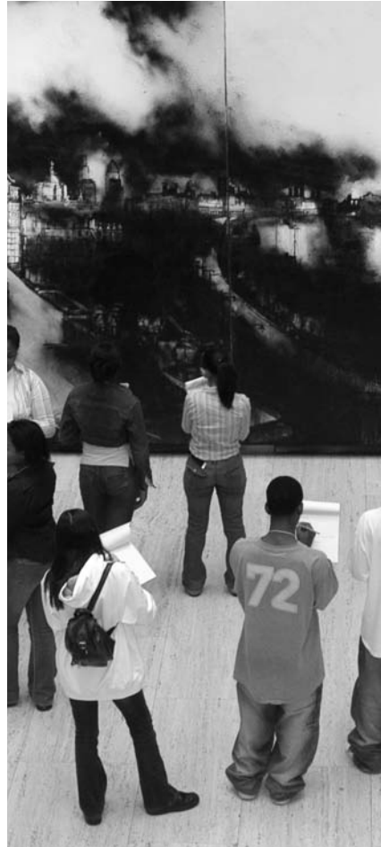
Harding High School students visit the Yale University Art Gallery as part of their Peer Docent program training.

Last fall, enrollment at HCC reached 4,371. Many of these students will require some form of financial assistance during their course of study. In an effort to meet their needs and the expanding needs of the college, the Foundation has continued to actively pursue grants from private and public foundations. Recent activity includes the following: