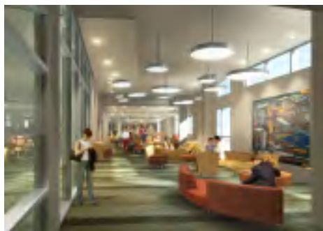
Architect's rendering of the new student lounge space.

There is currently no room for expansion of offerings at any of the critical time periods. One must always keep in mind that attendance patterns at community-technical colleges are typically bi-modal, mornings and evenings, largely due to the work and family responsibilities of the student population. Moving popular and/or necessary courses to the more available afternoon hours is usually not an alternative since students simply cannot attend class at those times. Also, there is no room to provide for the development of new programs or even the expansion of current programs. Although the greatest current need is for general purpose classrooms, there are also needs for student spaces, the growing Theater Art Program, and a large multi-purpose area.