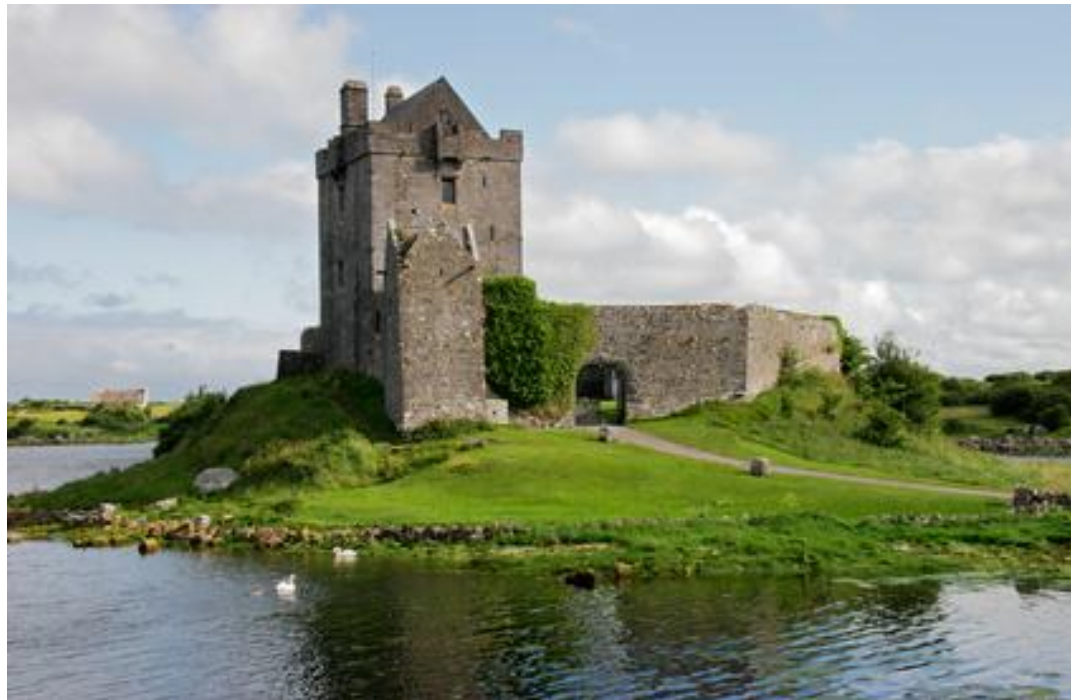
Photograph at top right: Dunguaire Castle, Kinvara Bay, Galway, Ireland

Listen to the special audio file distributed with this newsletter!