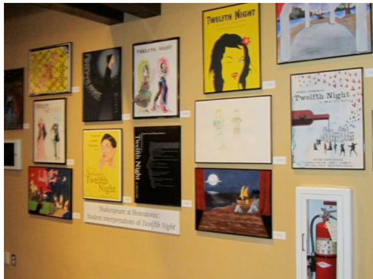
Housatonic student interpretations of William Shakespeare's Twelfth Night, or What You Will on display at the Westport Playhouse's production of the play in October.

The VFA developed its metric and an accompanying manual over a 5-month period with the help of 58 community colleges, both large and small and including two state systems.